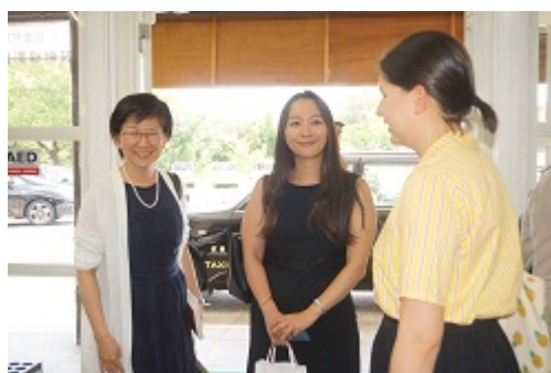
U.N. group at conclusion of Hiroshima Laboratory visit